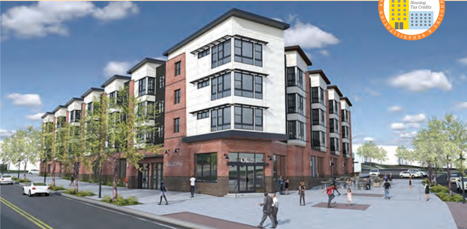
Living Word Church's Trinity Plaza in Washington, DC