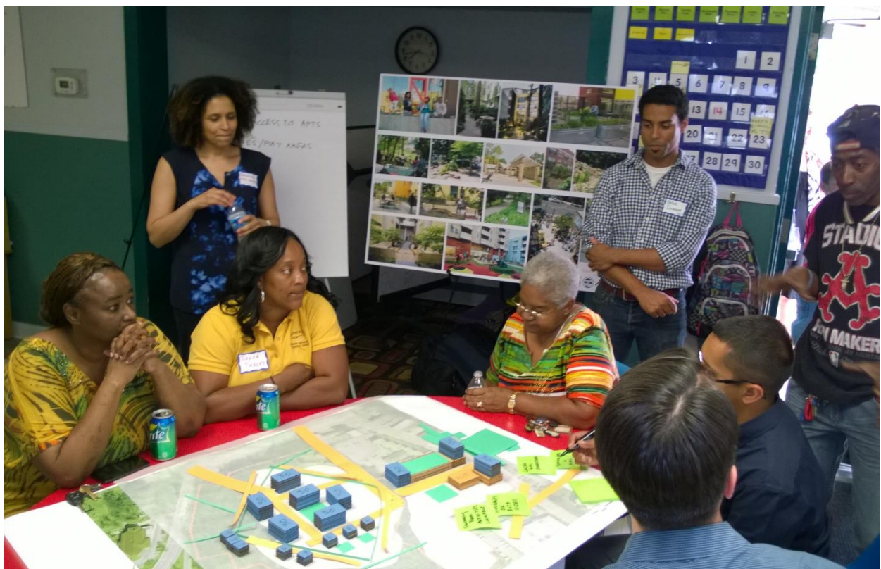
Figure 2: Lee Walker Heights resident Design Charrette.

Ensure that there is continued community collaboration at Lee Walker Heights as construction moves forward.