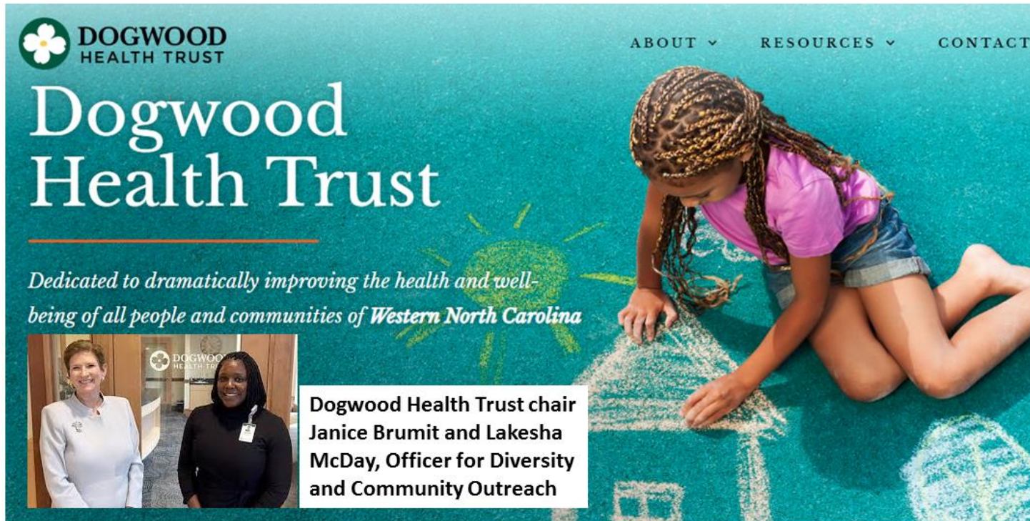
Figure 1: Recently formed Dogwood Health Trust will provide $50 million or more each year beginning in 2020 across the 18 counties that comprise the Mission Health service area in western North Carolina.

Position Mountain Housing Opportunities as North Carolina’s housing provider at the forefront of social determinants of health utilizing resources available through the Dogwood Health Trust and other community health partners.