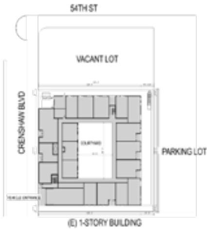
Conceptual Site Plan