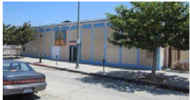
Existing Building, to be demolished