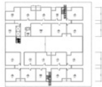
Conceptual Floor Plan