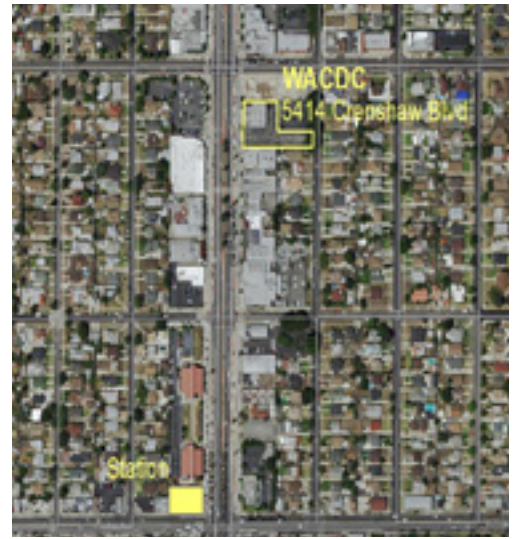
Site Relative to Slauson and Crenshaw station/stop for the Crenshaw/LAX line (1200 Ft)