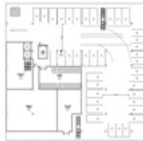
Conceptual Floor Plan