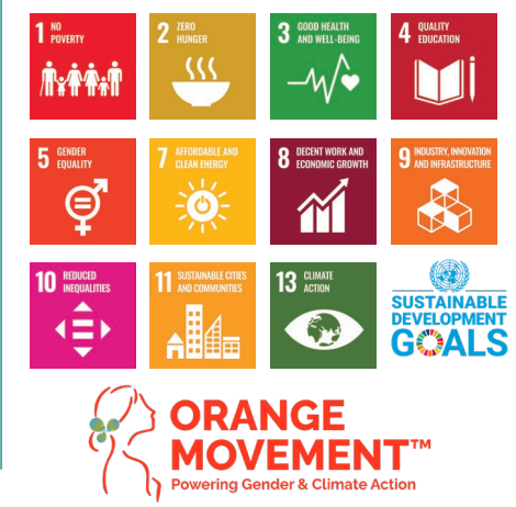
Working towards 11 of the UN Sustainable Development Goals