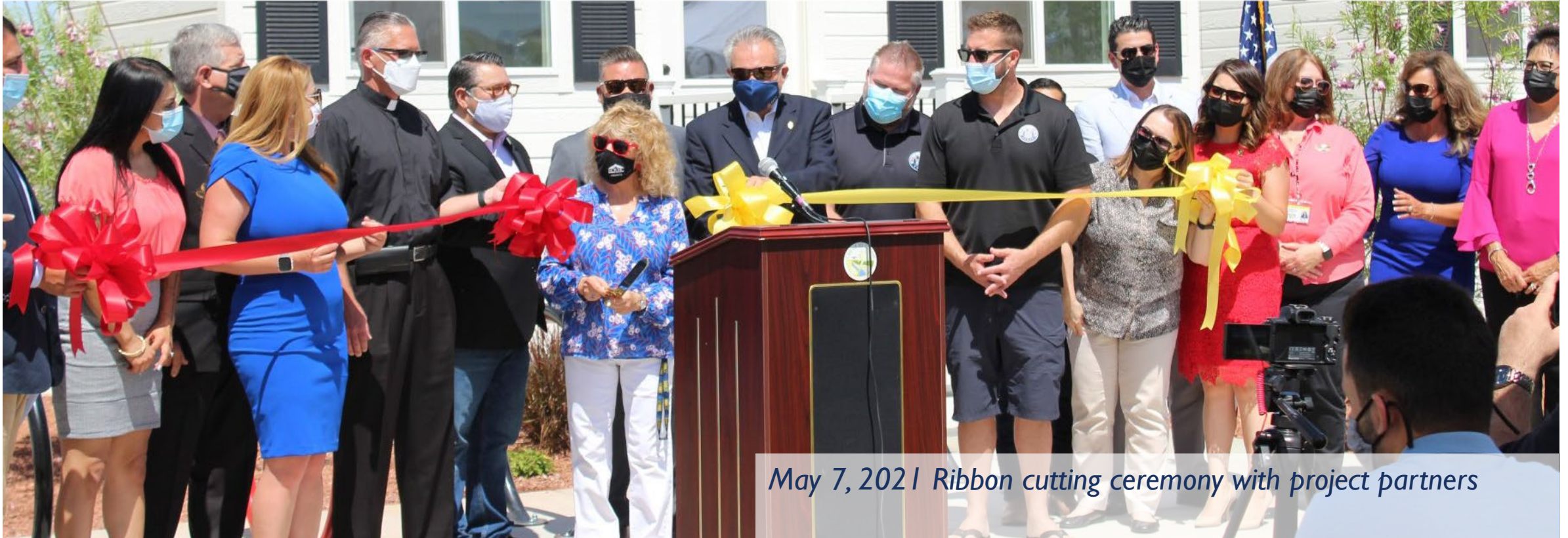
May 7, 2021 | Ribbon cutting ceremony with project partners