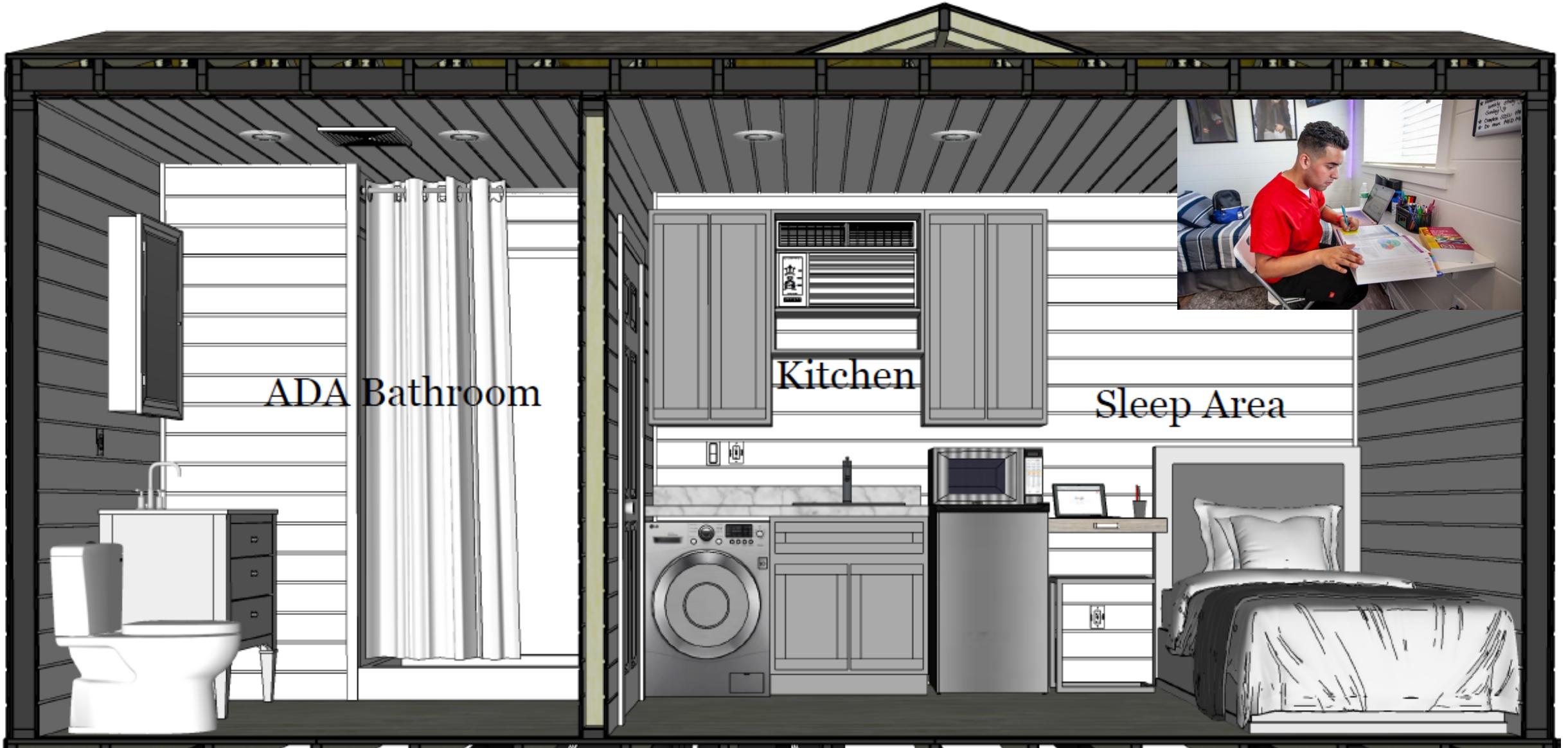
Each tiny home is 170 square feet and includes a kitchen, restroom, bed, desk, closet, patio and washer and dryer stacked units.