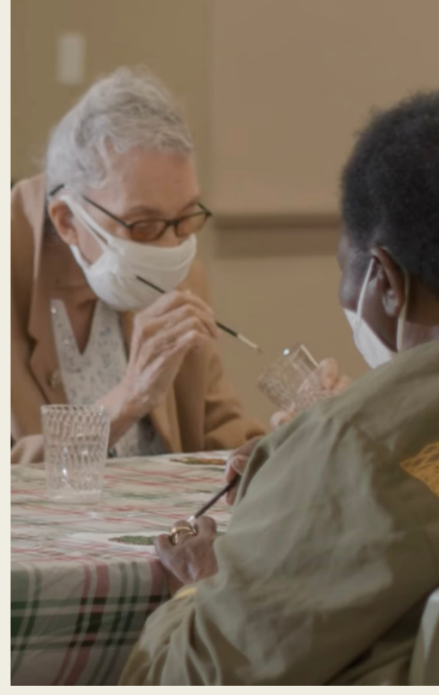
The 'Golden Girls' enjoy crafts through resident services at Hollins House.