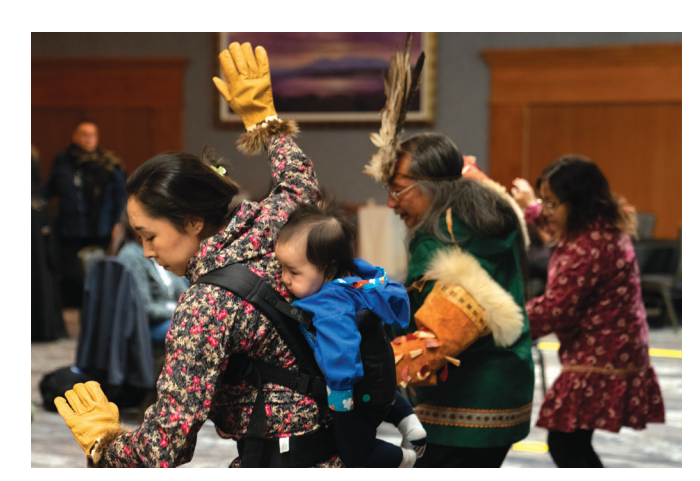
The King Island Dancers performed tribal stories at the summit's welcome reception.