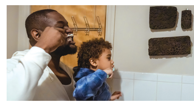
Childhood lead poisoning in Cleveland is four times the national average.