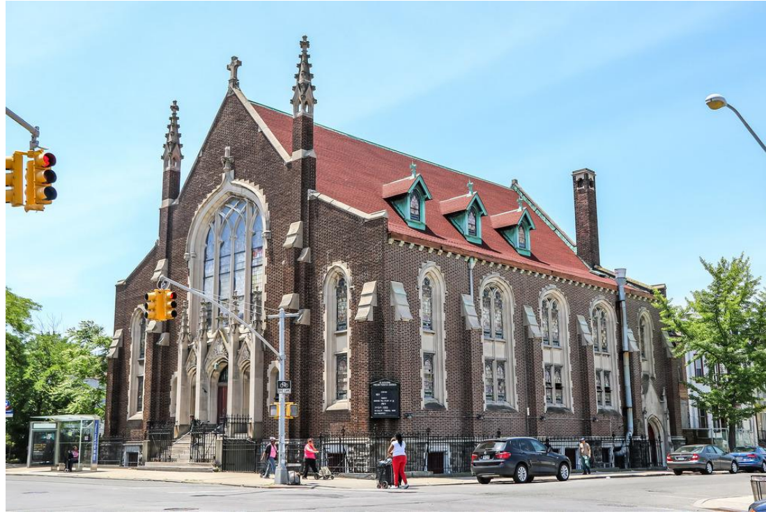
St. Augustine Presbyterian Church Present Day