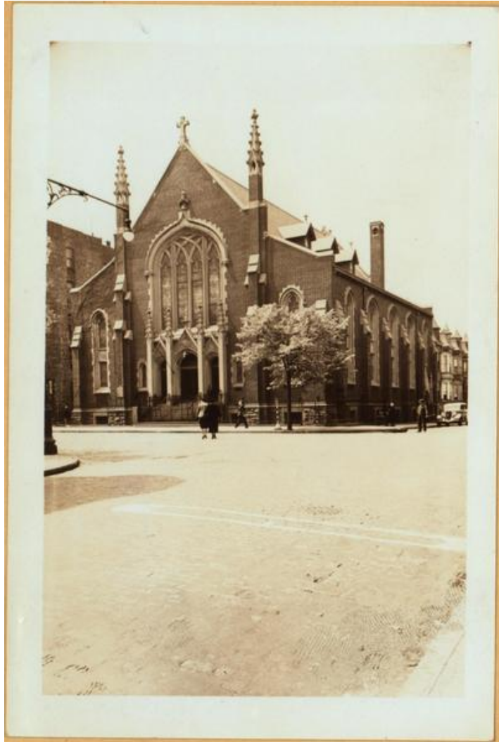
St. Augustine Presbyterian Church 1938