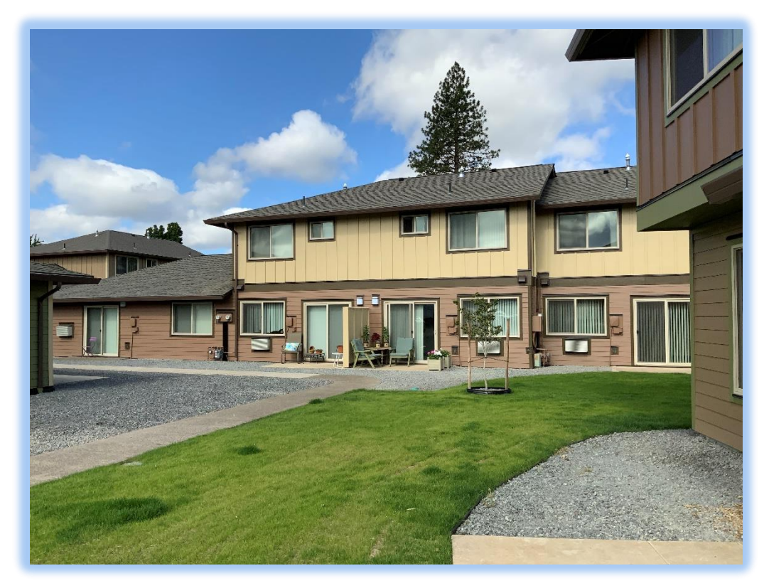
The Greens, Molalla, Section 8